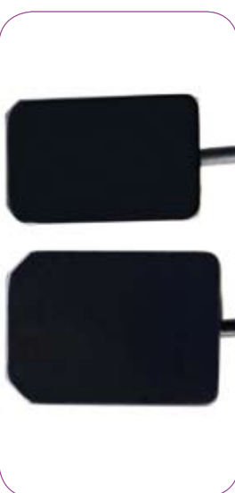
Reliable and durable, available in two sizes.

Bluetooth 2 is the widely adopted wireless communication technology that allows for fast image transfer to your PC only, truly respecting patient privacy. The MyRay patented interference-free implementation makes it even more reliable and safe.