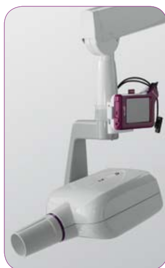
Smart Holster available, attach the X-pod to any surface.