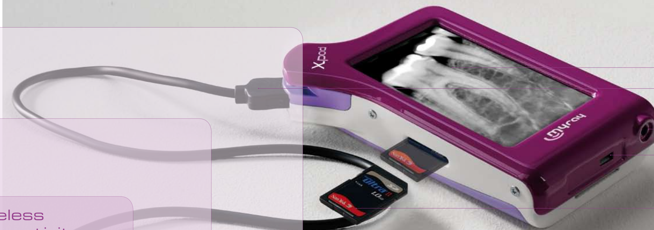
High definition, touch-sensitive display.